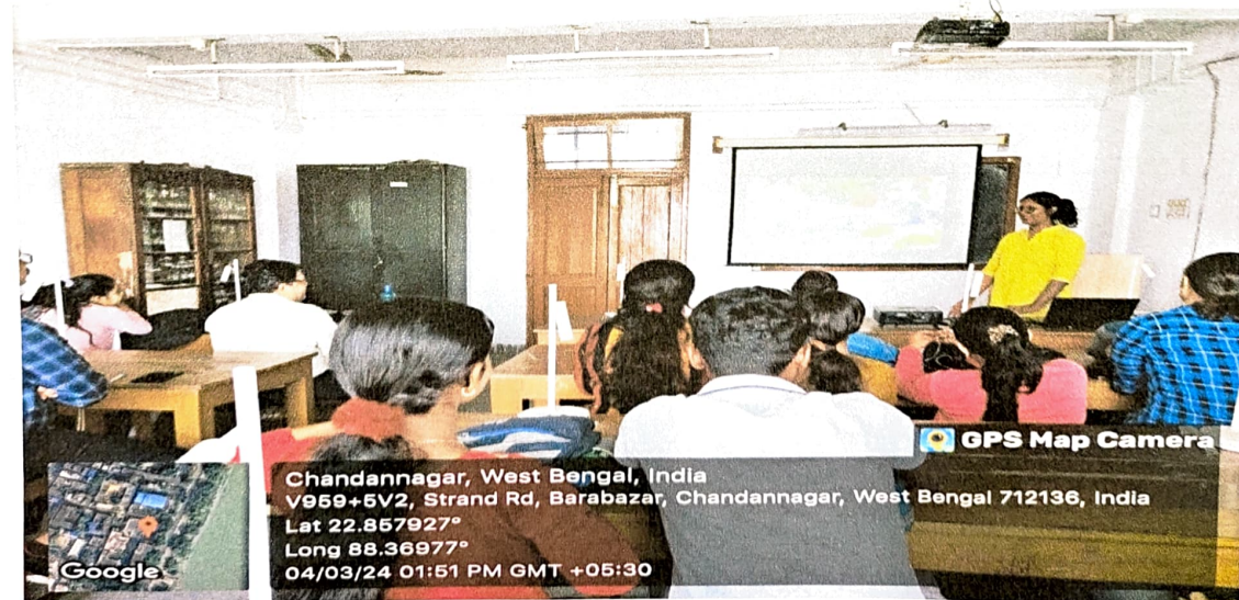
Photographs on awareness programme conducted at Chandernagore College on 4 th March, 2024 with the student of UG